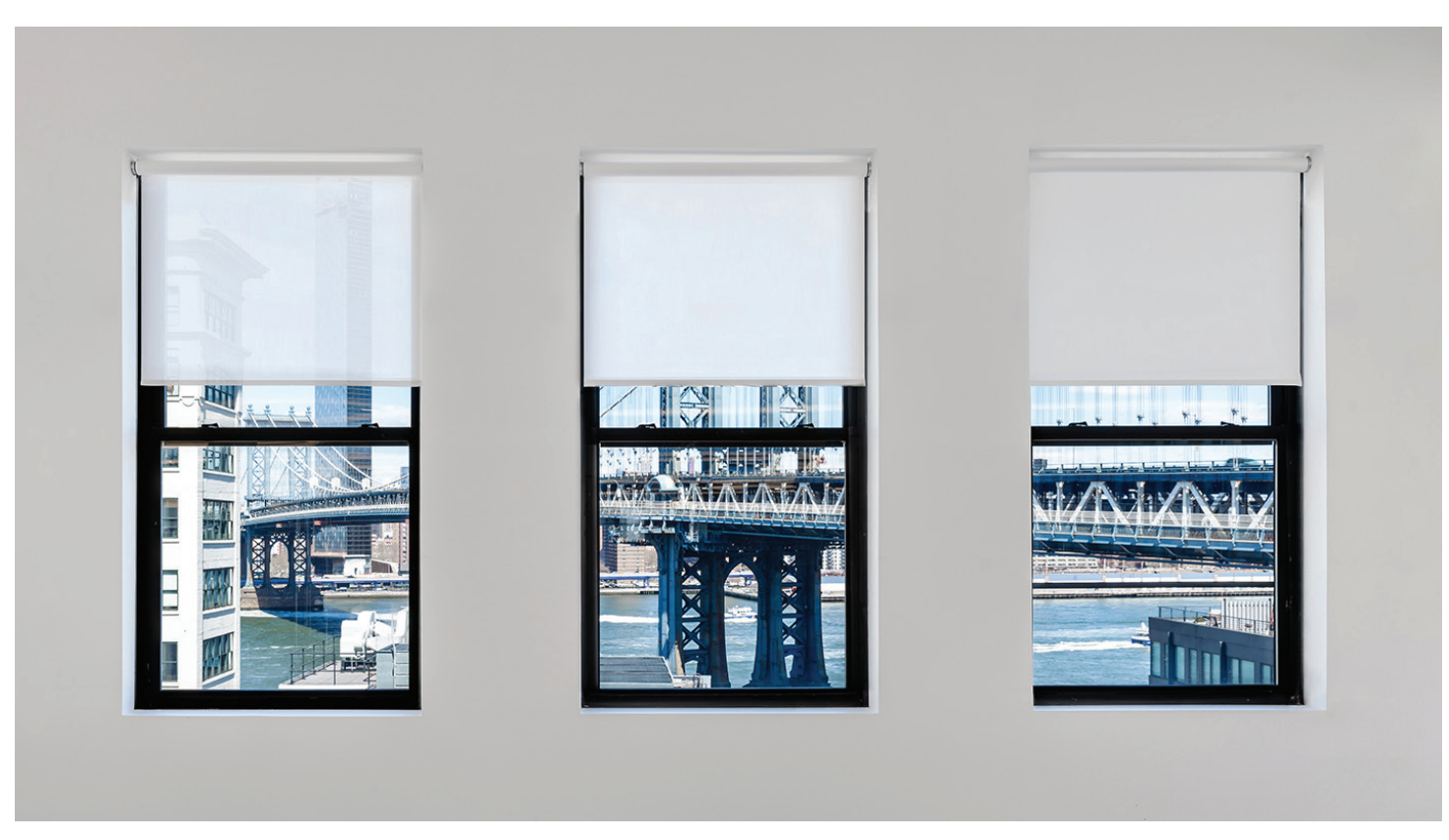
Pictured left to right: Sheer, Translucent, Blackout